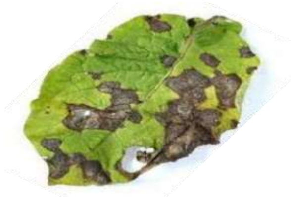
Fig.1. plant that is ailing